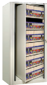
Ez2 ® Rotary Action File