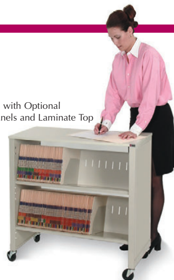
Shown with Optional End Panels and Laminate Top