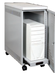
CPU Locker ™