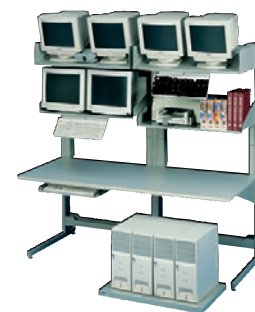
Technical Furniture Systems ™