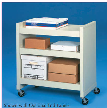
Shown with Optional End Panels