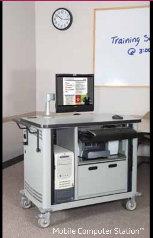
Mobile Computer Station™