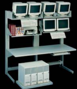
Technical Furniture Systems™