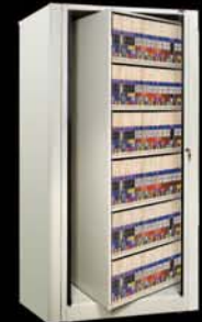
Ez2® Rotary Action File